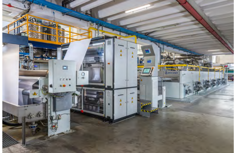
Mahlo combination system with Orthomax RFMB and Optipac VMC process control on a stenter in the finishing area.