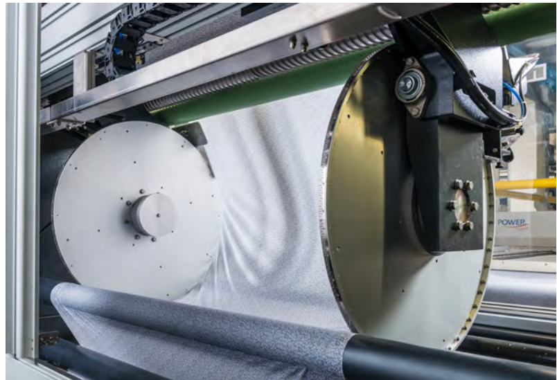
The patented adjustable unclipping roller stands out among the pin wheels. It minimises residual bow and edge distortions when unclipping the web.