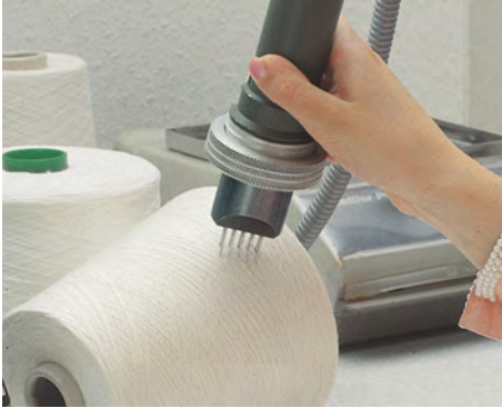
Moisture measurement on bobbins

There is a physical relationship between the moisture content and electric conductivity of hygroscopic materials. It follows a specific curve for each type of material. The Textometer DMB has therefore stored calibration curves of different materials. The matching calibration data is automatically preset by the choice of fibre type or mix of fibre types. The device is immediately ready for use.