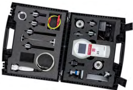
Fully loaded accessories case (example)

The user selects the most common types of fibres and their composition via the touchscreen. The mixing ratio can be adjusted in 5% increments. The measured values can be stored in separate memory banks and thus divided into different categories (e.g. different types of fabric). An integrated USB interface facilitates transfer of the stored data to a PC.